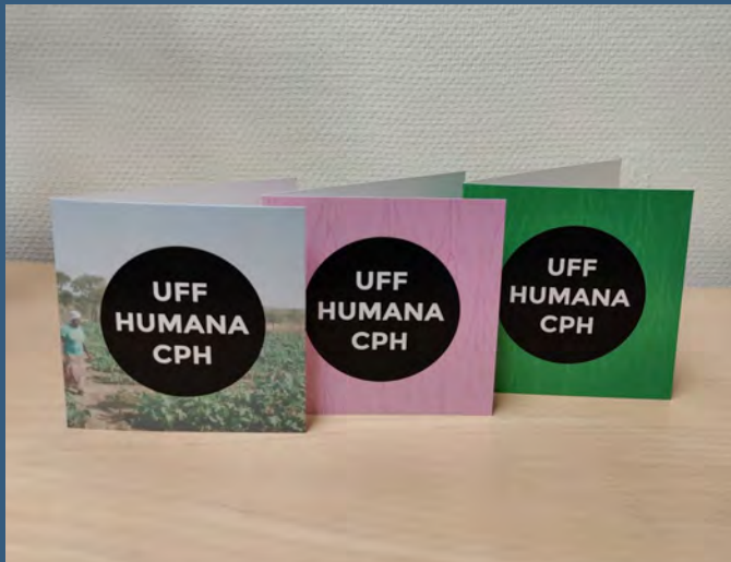
The gift cards are available in three different designs.

UFF Humana Second Hand has gotten nice new Gift Cards, which are available in all three stores: Vesterbrogade 50, Nørrebrogade 34 and Istedgade 97 in Copenhagen.