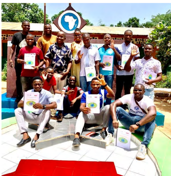
Students pose with a manual on environmental health.

The Teacher Training College in Bachil, Guinea-Bissau, has been working with an initiative that focuses on the connection between environment and health, since the end of 2023. The program is about the health of both the individual and our planet, and trains teachers through interdisciplinary courses that promote environmental engagement and social responsibility. The goal is to develop effective, inclusive and concrete solutions, which teachers can share with the most vulnerable people living in rural areas, who are close to the effects of climate change. Teachers are trained to develop initiatives tailored to the specific needs of their local communities to promote the environment, health and climate resilience. We look forward to following the further development of the project.