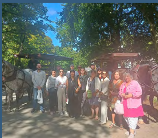
Group photo with the horse-drawn carriages.

In August we had a UFF-Humana's staff trip to "Dyrehaven". The day started with a horse-drawn carriage ride, followed by a trip to Dyrehavsbakken, where the employees tested their nerves on various rides. The day ended with a meal in more relaxed surroundings.