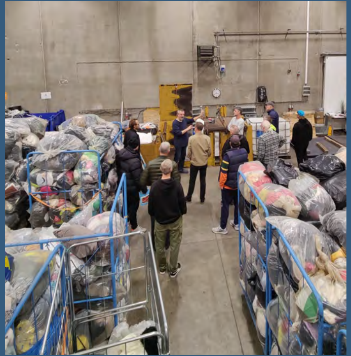
A group of employees from ARC visiting UFF-Humana.

At UFF-Humana, we still notice a growing interest from the municipalities in finding competent handlers for the textile waste that they collect themselves, and we are happy to be able to contribute to this.