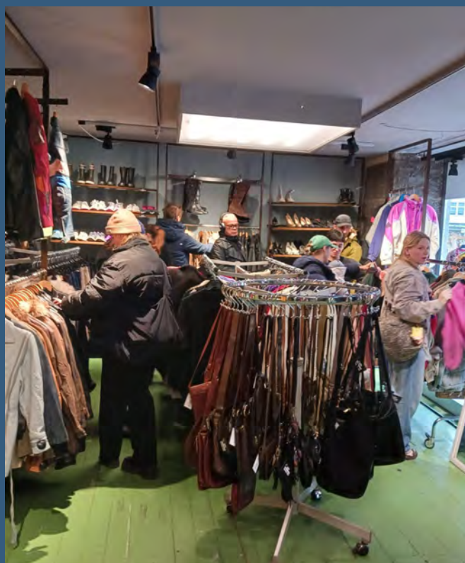
The very atmospheric premises on Istedgade 97 are now filled with trend and vintage pieces.