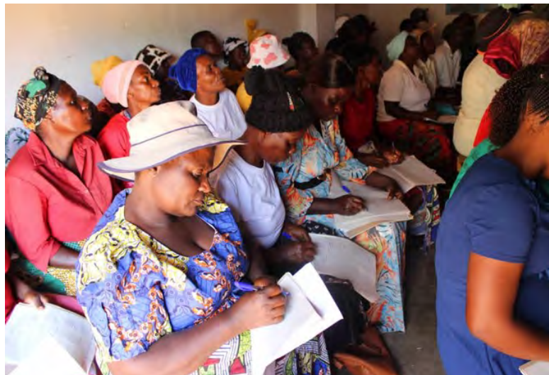
Farmers receiving education about water irrigation systems.

We look forward to sharing updates on this project and its impact on the communities in Chimanimani, Zimbabwe.