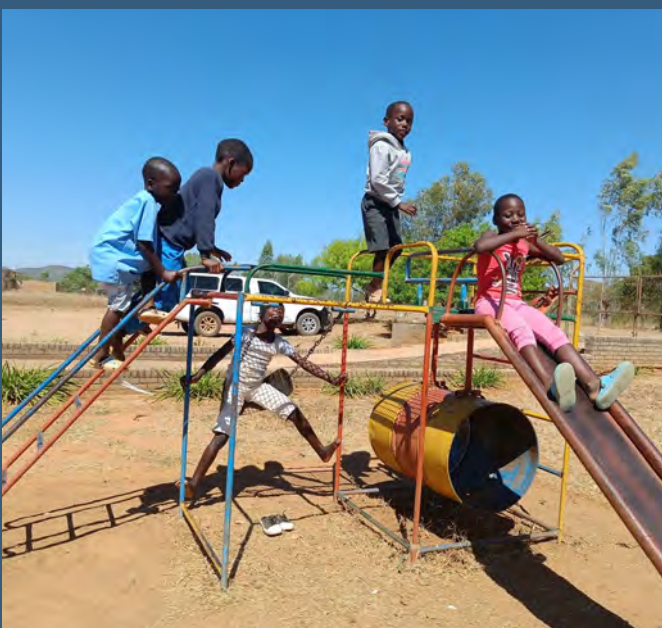
The Playground at the Children's Home is almost always in use!